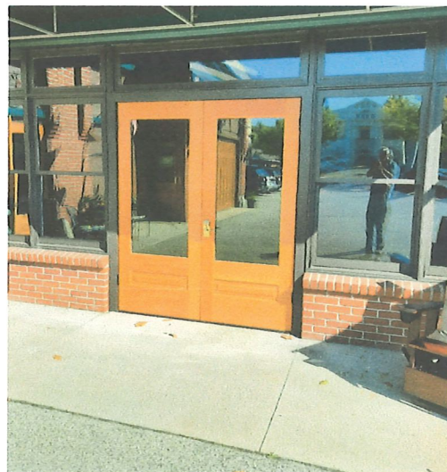
Front windows of Unit #6 before tinting AFTER