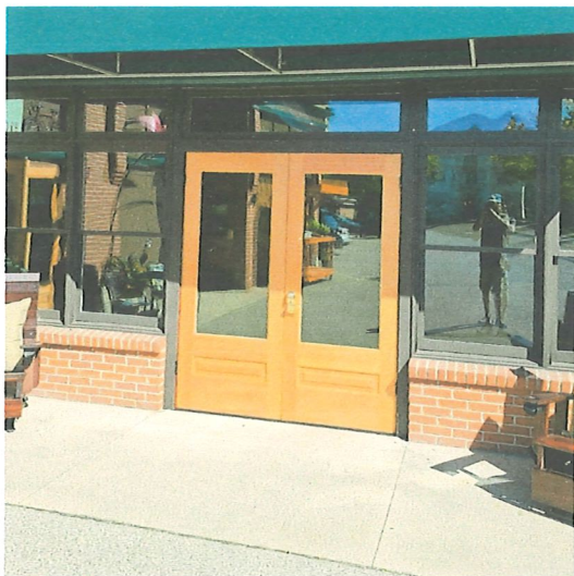
Front windows of Unit #6 before tinting